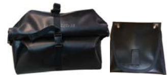
ballast sand bag 20 kg righting rope kit