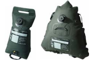
6 USG fuel bladder 6 USG – 22,7 L 18 USG fuel bladder 6 USG – 68 L