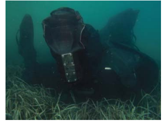
underwater engine bag stainless steel protection shoe