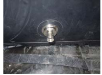
fast inflation connector