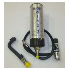
Venturi immersion kit