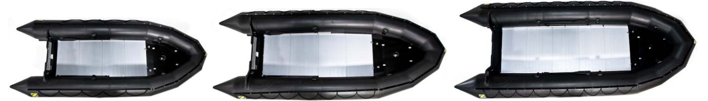
MK 4 HD